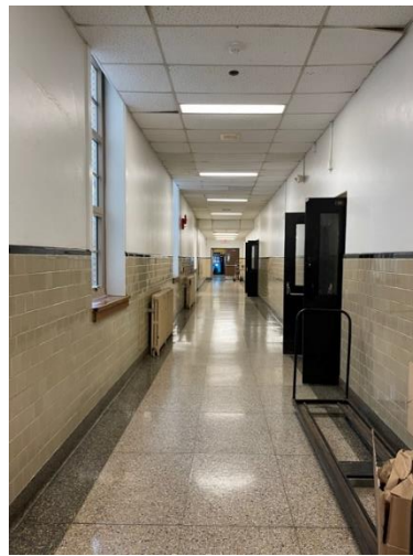
Camera junction boxes