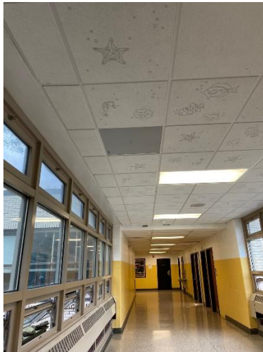
Drop ceiling speakers