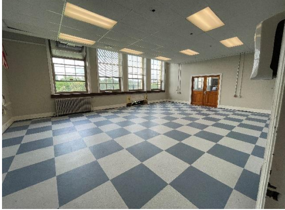
GREENPORT SCHOOL PROJECT- B & C